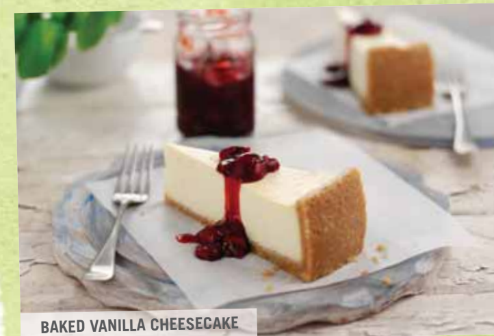
BAKED VANILLA CHEESECAKE

Not included in the 2-for-1 dessert offer.