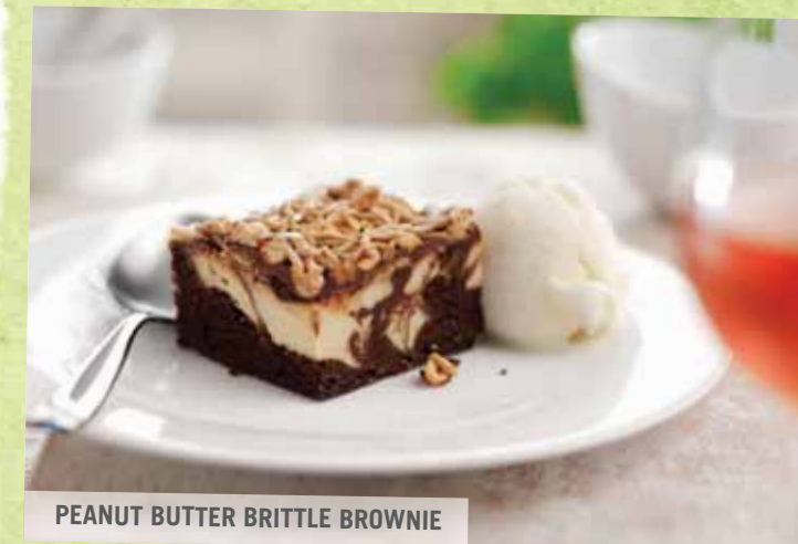
PEANUT BUTTER BRITTLE BROWNIE