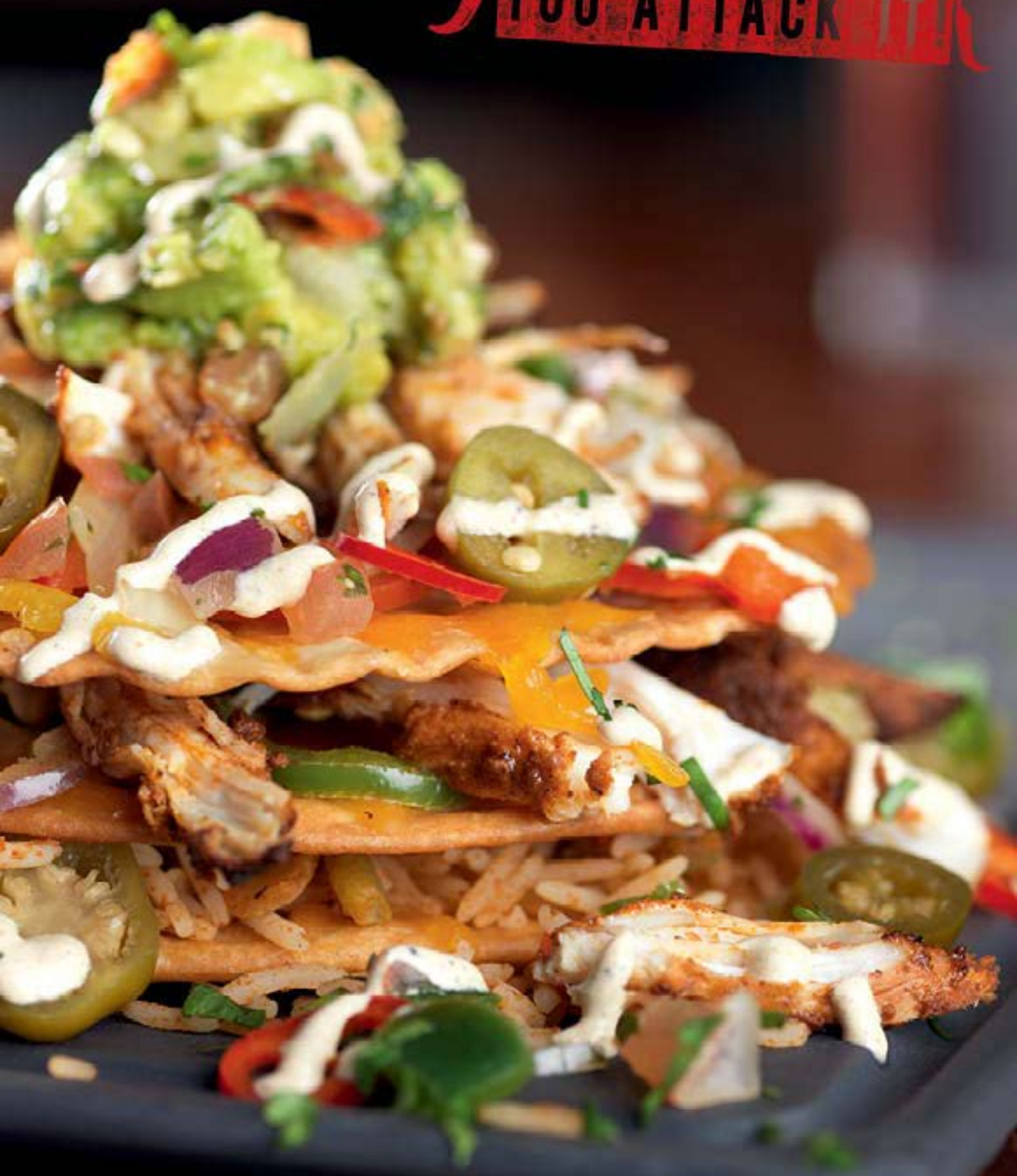
Cajun-Spiced Chicken Crispy Tostada Stack